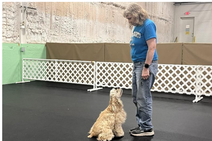
DDTC February 2026 ©