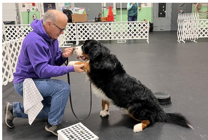
DDTC February 2026 ©